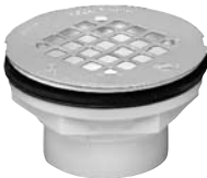
42097 Shower Drain