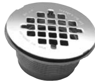
42099 Shower Drain