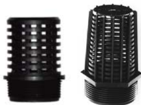
1800 Series (hex and round)