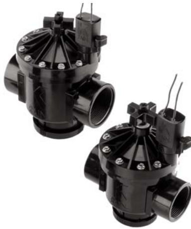
7102 and 7115 Series