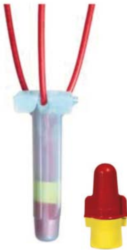
HDBR/Y-6 Splice Tube and Connector