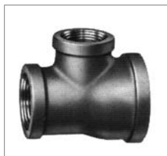
BT Reducer Series