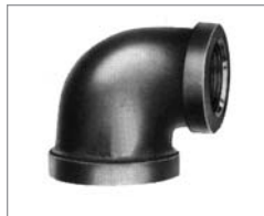
B90L Reducer Series