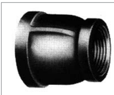
BC Reducer Series

Case quantities required please for fittings through 2"