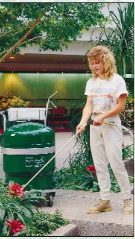
Aquamate Model #4

And because Aquamate<sup>™</sup> machines are integrated watering systems, they eliminate the hazards associated with hauling those buckets and hoses. Your liability is reduced, you and your customers are protected and you look good on the job. So, what sounds better to you — operating a state of the art watering system or carrying around the same old can?