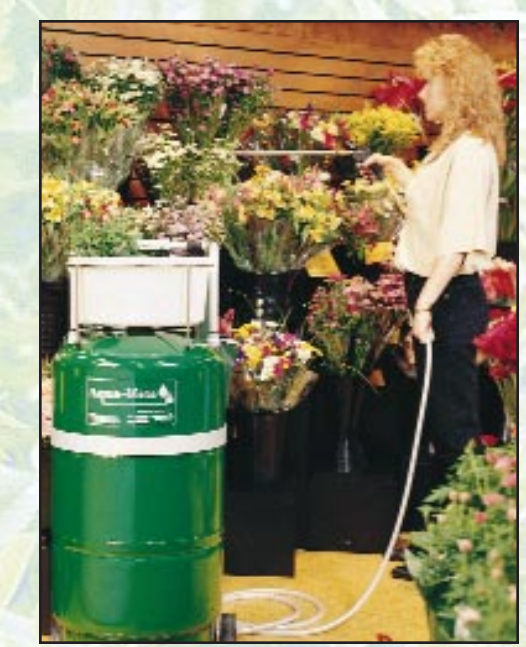
Aquamate Model #3