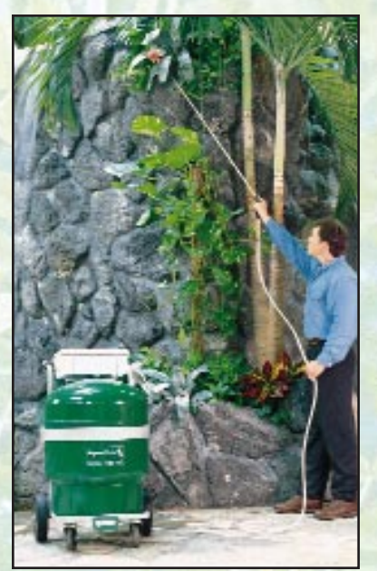
Aquamate Model #4

Aquamatics has been manufacturing and selling Aquamate<sup>™</sup> watering systems for more than 25 years. Our machines are designed to last for years and years with little maintenance.