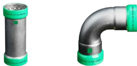
MECHPRESS | MECHANICAL & FIRE PROTECTION