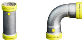
MECHPRESS-G | GAS & FUEL OIL