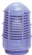
FV SN Series