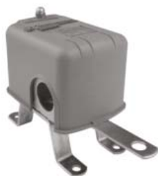
9036DG Series ISO 9001