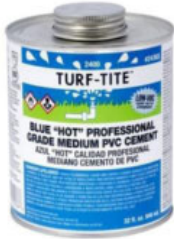
2400 Series BLUE