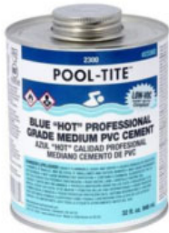
2300 Series BLUE